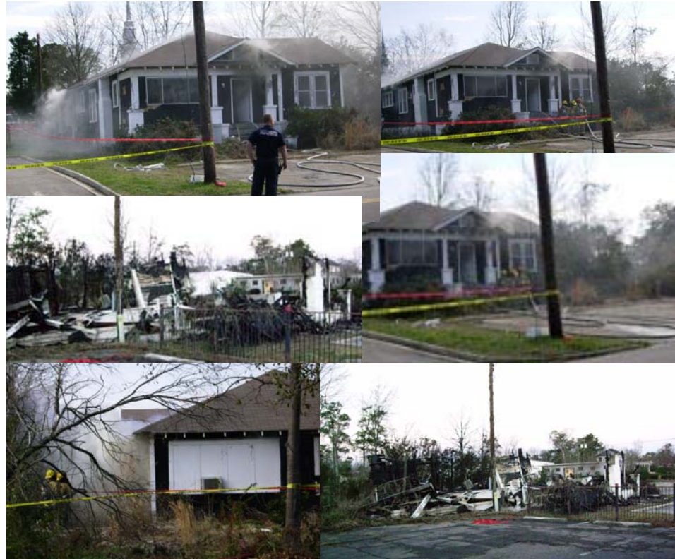
TRINITY EPISCOPAL CHURCH